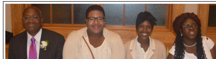
GCA's 2018 Honored Graduates