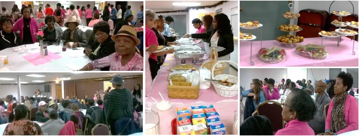
These photos were taken last month at the GCA Ladies Breakfast. Discussion: Breast Cancer Clinical Trials from the staff of Fox Chase Cancer Center.