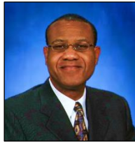
By Dwight Neilson