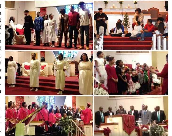
2018 Christmas Program • Just for Me • King's Kids • Voices of Praise • Male Chorus